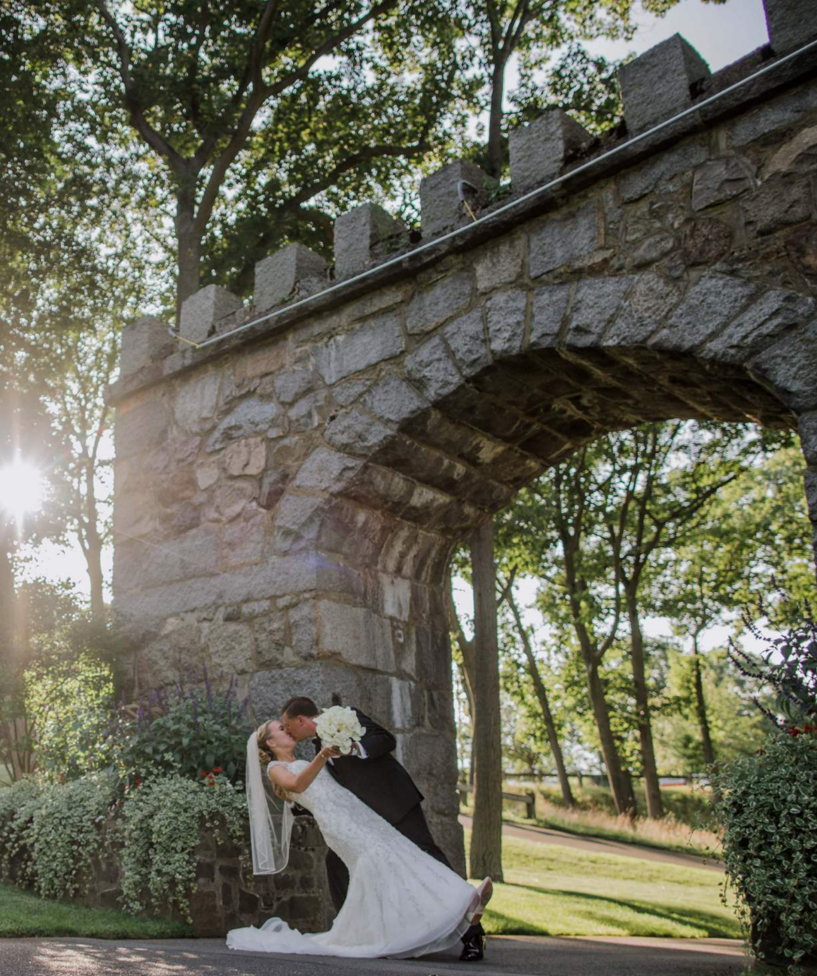
Kernwood Country Club, 1 Kernwood Street, Salem, MA 01970